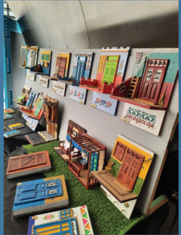
Wooden Furniture" event

On the other hand, NMEC in cooperation with the Art Home Luxor Foundation, the Deketnorag Foundation organized a workshop on Egypt's distinctive pieces of furniture that in turn formed the identity of Egyptian homes in rural and Upper Egypt. The event witnessed the participation of Egyptian artists who reproduced ancient folk furniture in an attractive modern way, where NMEC's visitors interacted with the experience of sculpting and designing the handmade arts.