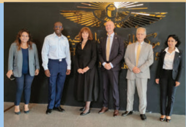
The Assistant Secretary General of NATO for Political and Security Affairs