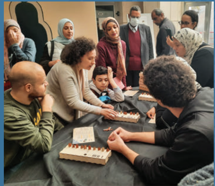
Senent...a day with a game

On the other hand, NMEC organized an event on the Senet gameboard in cooperation with Khazanah and GebRaa. The event's program included an introductory seminar about the Senet gameboard among a number of other activities related to games in Egyptian folklore.