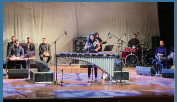
Marimba player celebration