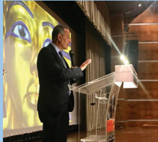
Celebration of the 100th Anniversary of the Discovery of Tutankhamun's Tomb

The celebration also included an exhibition of photographs under the title 'Novels We Didn't Witness: The Tomb of Tutankhamun,' which displayed a group of rare photos that are related to the story of the discovery of the tomb between 1922 and 1930, and the role of the Egyptians in this unique archaeological discovery, in addition to displaying content for scenes from the tomb and its treasures on the main screens of NMEC located at the entrance to the Hall of the Royal Mummies.