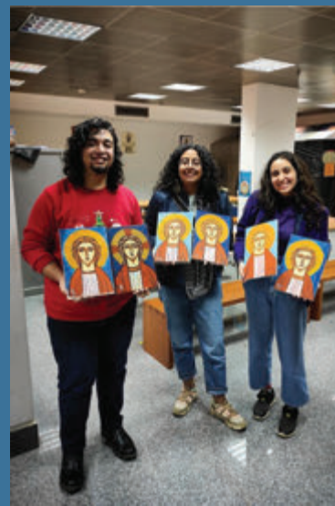
Workshops discover your technical skills

NMEC also organized a group of artistic workshops under the title "Discover your artistic skills for youth and children in all plastic arts such as pottery, ceramic paste, printing on textiles, ornaments, veneer wood, leather and Coptic icons. These workshops aim to discover the skills of the participants and develop their creative side. These workshops were carried out through a group of Students of art education within the activities of the practical side of their studies, and the workshops ended with making gifts to celebrate the new year with NMEC visitors of different nationalities, in which a link was made between Egyptian arts and international forms of welcoming the new year, such as the Christmas tree.