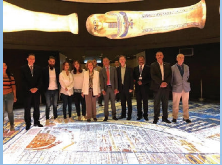
The Queen of Spain