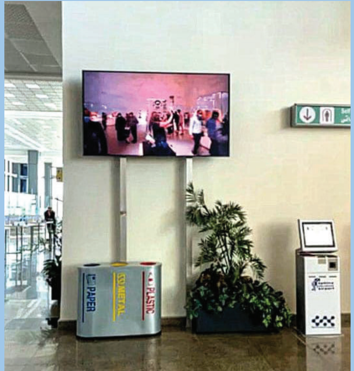
Showing Ads for NMEC in the halls of Sphinx International Airport

Sphinx International Airport begins showing ads for NMEC on screens located inside the arrival and departure halls at the airport; this comes in coordination between the Ministry of Tourism and Antiquities represented by NMEC, and the Ministry of Civil Aviation represented by the Sphinx International Airport.