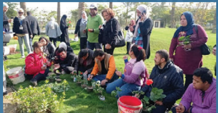
Green recycling workshop

During the workshop, the participants recycled a group of unused plastic materials, and learned the art of turning them into colorful plant pots, which they planted with some plants in NMEC's garden, and learned about the types of plants in NMEC's garden, and the importance of their existence and their important role in reducing emissions and harmful gases.