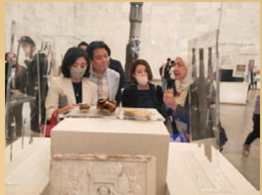
The Special Envoy of the President of the Republic of Korea