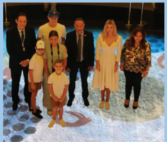
The daughter of the former US president