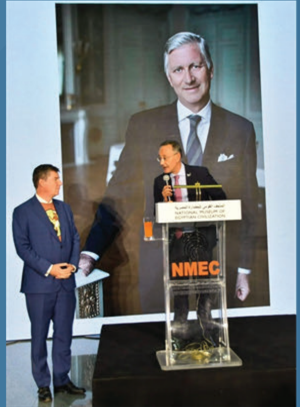
"Tintin" magazine exhibition

In celebration of the National Day of Belgium, NMEC organized a month-long photo exhibition featuring the adventures of the legendary Belgian toon Tintin in an ancient Egyptian royal tomb, a series remains one of the most popular comics in Egypt and the world in the 20th century. The character Tintin, a young Belgian reporter who is always accompanied with his dog Milo, was first introduced in Le Petit Vingtième , which was a weekly youth supplement to the Belgian newspaper Le Vingtième Siècle . During a trip to Egypt, Tintin try to find the tomb of the pharaoh.