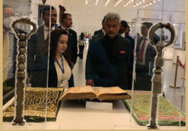
The Minister of External Affairs of India and his accompanying delegation