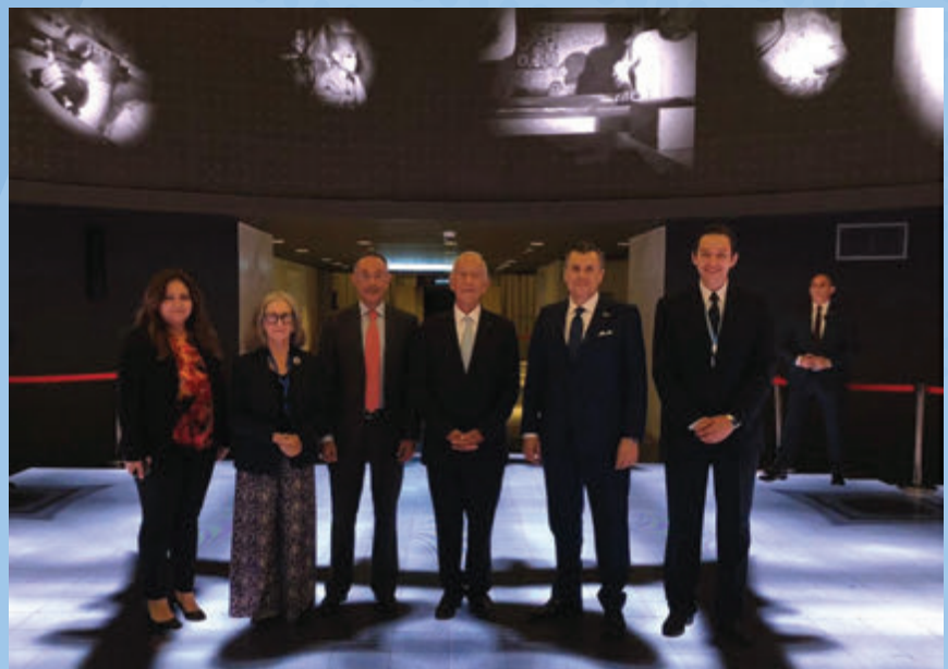
The President of the Republic of Portugal and his accompanying delegation

Moreover, NMEC welcomed a visit by Dr. Marcelo Rebelo de Souza, President of the Republic of Portugal, and his accompanying delegation, during which he was accompanied by Mr. Ahmed Issa; Egypt's Minister of Tourism and Antiquities.