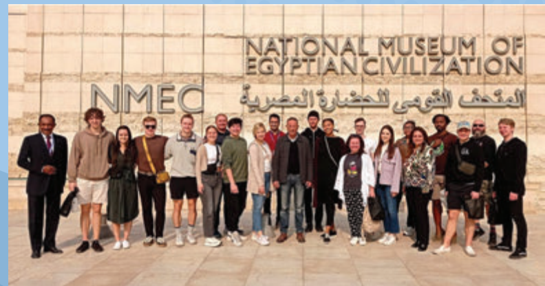
“Disney on Ice” team

NMEC welcomed the “Disney on Ice” team, whom were in Egypt to participate in the present world art exhibition of the famous Disney characters on ice. The team members expressed their happiness to be at this majestic monument, which is a witness to the history of ancient Egypt and its ancient civilization, confirming that they will be taking their positive impressions of NMEC to wherever they visit in the countries of the world.