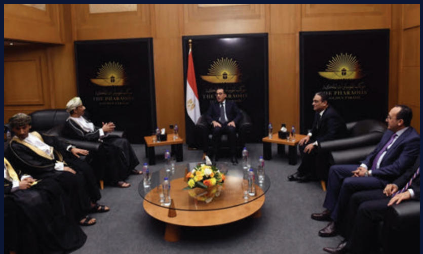
Celebration of the fifty-second National Day of the Sultanate of Oman

Dr. Mostafa Madbouly; Egypt's Prime Minister, witnessed the celebration of the fifty-second National Day of the Sultanate of Oman, and the passage of fifty years since the start of diplomatic relations between the Arab Republic of Egypt and the sisterly Sultanate of Oman, at the headquarters of NMEC.