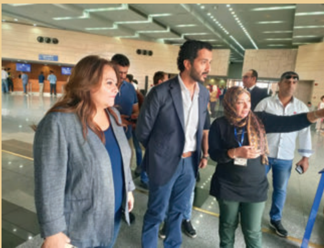
The UAE Minister of Economy and the UAE Minister of Culture and Youth

On the other hand, NMEC welcomed two high-level official delegations from the states of Greece and Cyprus, accompanied by H.E. Nikolaos Garilidis; Ambassador of Greece, and H.E. Polly Ioannou; Ambassador of Cyprus, General Democritus Zervakis; Chief of Staff of the Cypriot Army, and H.E. Boyar Ottomani; the Minister of Foreign Affairs of the Republic of North Macedonia;