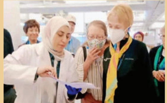
NMEC Restoration Center receives the first group of visitors