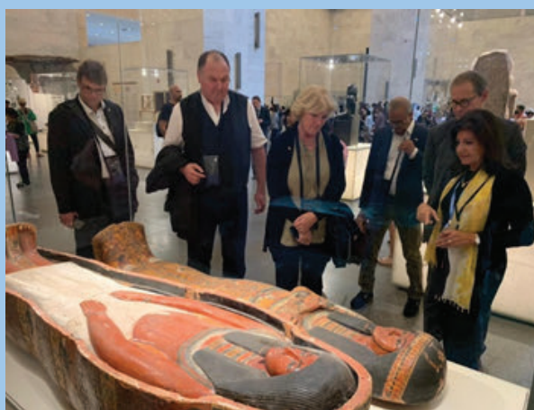
The German Parliament delegation