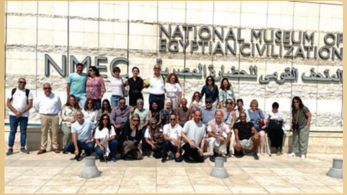
The delegation of the Ship for World Youth (SWY) program

NMEC welcomed the delegation of the Ship for World Youth (SWY) program under the general supervision of the International Youth Exchange Association affiliated to the Japanese Cabinet Office. In this program, distinguished members have been carefully selected from Egyptian youth of all ages. The program takes place once a year. The program aims to exchange cultures with countries of the world that have a special nature in cultural content and form the seeds of friendship between the Japanese people and the peoples of the world.