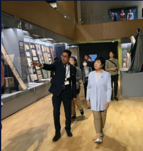
The Governor of Tokyo and her accompanying delegation