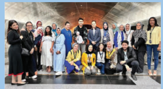
Celebration of the 100th Anniversary of the Discovery of Tutankhamun's Tomb