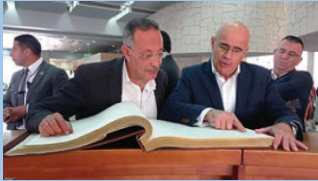
The Chief of Staff of the Cypriot Army