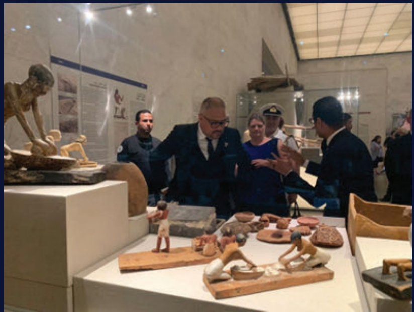
The Minister of Defense and Tourism of New Zealand and the accompanying delegation