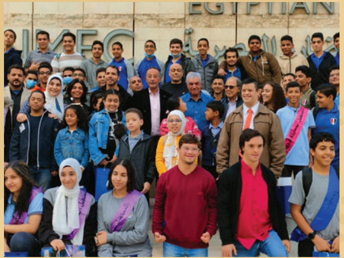
Secrets of the Pharaohs Lecture Team

The museum held a lecture by Dr. Zahi Hawass about the secrets of the pharaohs for children and students, where "Hawass" spoke about the secrets of mummification, and about the golden king Tutankhamun. At the end of the lecture, "Hawass" signed Tutankhamun's book The Little Golden Pharaoh , issued by the Nahdet Misr House for children and students, as they were given special duties to introduce more happiness provided by McDonald's.