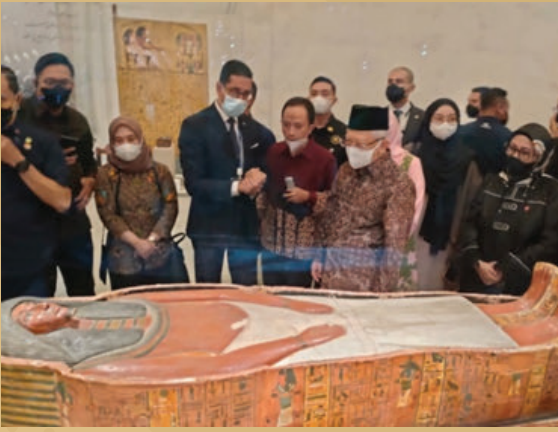
The Vice President of the Republic of Indonesia