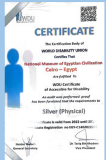
WDU Certificate of Accessible for Disability

NMEC obtained the WDU Certificate of Accessible for Disability from the World Disability Union in Sharjah, UAE. The certificate is granted to institutions that have environmental access that allow people with disabilities to visit them, thus having the opportunity to be equally included in the museum's activities and events, as cultural products should reach all segments of society, allowing them to understand the heritage of their civilization and take pride in their nation. Since its opening, NMEC has eagerly provided all the needs of people with disabilities in the course of the visit, starting from the entrance door to the exit, which was checked according to international standards and to ensure that the museum is qualified to receive them.