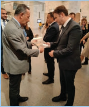
The Minister of Foreign Affairs of the Republic of Macedonia