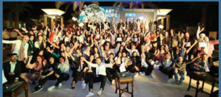
Exhibition "Art is a message that makes change"

Under the slogan "Art is a message that creates change", an art exhibition on waste recycling was inaugurated at NMEC's outer yard, in cooperation with the Faculty of Fine Arts, Helwan University, who presented a group of artistic and creative works that shed light on local and global climate change. The projects aimed at delivering a message to the society on the negative impacts of solid waste, and poor waste management on the environment and human health.