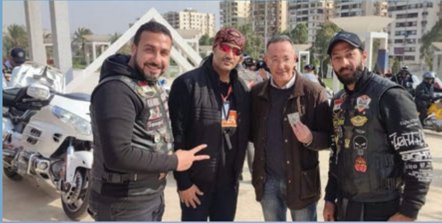
The United Motors Team and the Egyptian Mega Team

On the other hand, NMEC received the United Cars and Motorcycles team from Saudi Arabia and the Egyptian Mega team from the Ministry of Youth and Sports. The two teams were participating in the International Sports Exhibition “Expo sports 2023”, which is hosted by Egypt from 26 December to 8 January. The delegation included 50 motorcycle driving professionals from Egypt and Saudi Arabia, where they toured the various halls of NMEC. During the tour, the team members expressed their keenness to visit NMEC while they were in Egypt to participate in this sporting event, and praised the magnificence of NMEC and its holdings. They were also keen to record their visit by taking memorial photos to commemorate this visit, pointing out that they will publish them on their accounts on their social media platforms to express their pride in the Egyptian civilization and this great edifice.