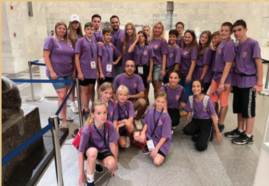
Children of the world visit NMEC

Within NMEC's framework to activate its role and mission as a cultural and an educational edifice, NMEC hosted 350 children from 16 Arab, European and Asian countries, on the sidelines of their visit to Egypt to participate in the "Children of the World" festival held under the slogan "Children of the World Meet".