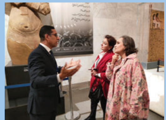
The wife of the Lebanese Prime Minister