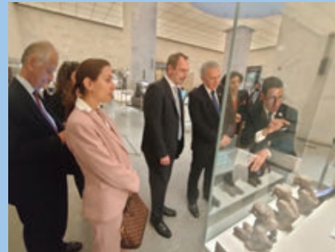
The delegation from Greece and Cyprus

On the other hand, NMEC welcomed two high-level official delegations from the states of Greece and Cyprus, accompanied by H.E. Nikolaos Garilidis; Ambassador of Greece, and H.E. Polly Ioannou; Ambassador of Cyprus, General Democritus Zervakis; Chief of Staff of the Cypriot Army, and H.E. Boyar Ottomani; the Minister of Foreign Affairs of the Republic of North Macedonia;