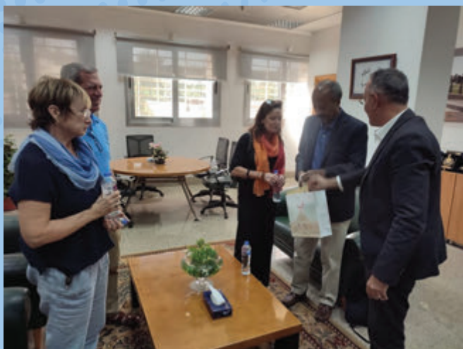
The Hollywood star