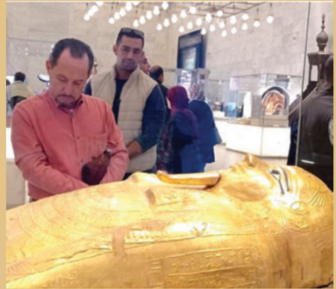
The Chargé d’Affaires of the American Ambassador and his family