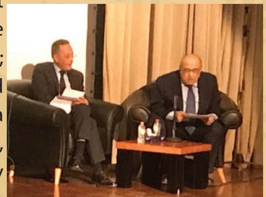
Symposium for the writer and political thinker Dr. Mustafa al-Feki